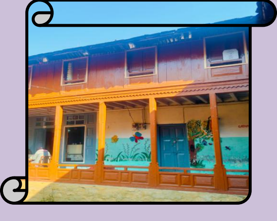
Nursery to V (Nursery Age - 3+ Years) (From 1<sup>st</sup> FEB 2025)